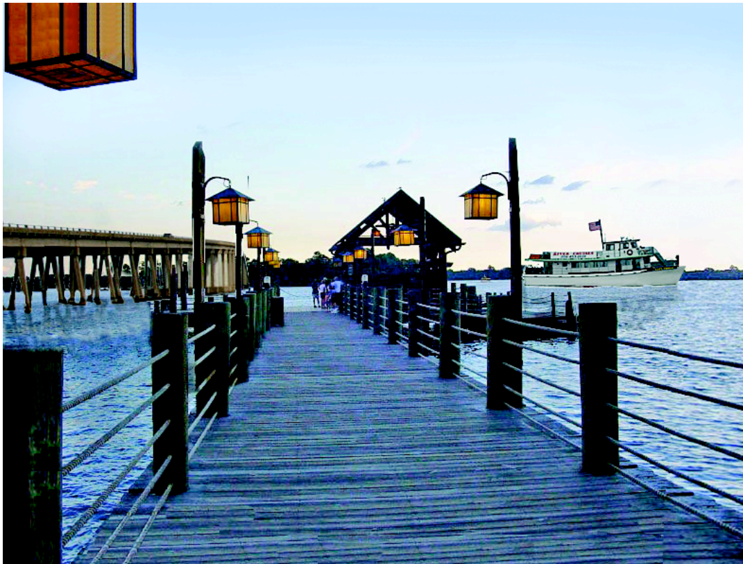
Photo caption: Tappahannock on the Rappahannock – a Main Street concept of a river-front park and pier that finally connects the river and the community together again.